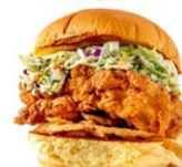
So Fresh & So Green