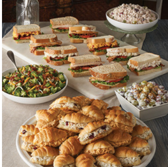
Chicken Salad Chick