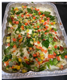
Marguerites - Veggie Lasagna

You have the power to change a $20 billion industry. Be a 21st-century pioneer—choose LoCo. With us, you and the community win!